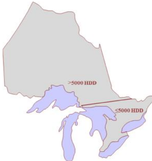
Figure 2 – Energy Performance Zones

Figure 2 illustrates the approximate division of the province. The line runs from south of Sault Ste. Marie to Pembroke.